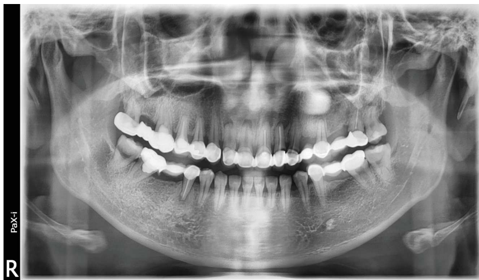
Figure(1) Panoramic radiograph represent periapical changes of abutments of fixed dental prosthesis

Abutments teeth were recorded. Cantilevers were recorded and the periapical status of abutment teeth were evaluated. Restorations were assessed in terms of complying the requirements of Ante’s law and recorded as “Complies” or “Does not comply”.