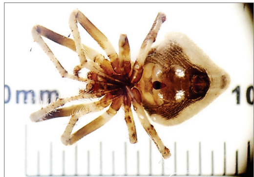
Figure 2: Ventral view of the orb-weaver spider E. poonaensis (Tikader & Bal, 1981), adult female