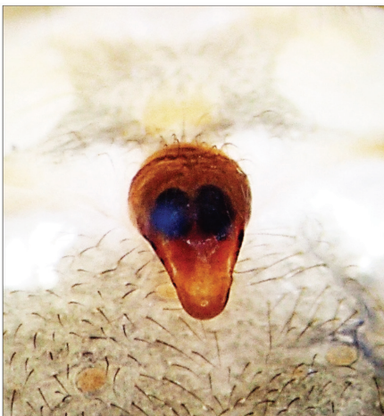
Figure 3: The orb-weaver spider E. poonaensis (Tikader & Bal, 1981), ventral view of Epigyne