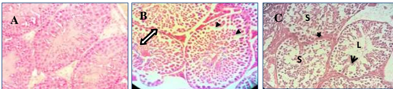
Figure 1. A photomicrograph of a testicular tissue from the control mice (A) showing the normal structure of seminiferous tubules and the interstitial spaces also appear normal. (B) a photomicrograph of a testicular tissue of 500 mg/kg CPFx treated mice showing disorganization of germinal epithelium in some seminiferous tubules (double head arrow) and loss of some spermatogenic cells (black triangle). (C) a photomicrograph of a testicular tissue of 750 mg/kg CPFx treated mice showing a thickness in basement membrane (star), sloughing of germ cells into tubular lumen (S), vacuoles (head arrow) and absent of sperm in lumen (L). (H & E 40 x)

The testicular tissues of control mice showed the presence of a normal testicular structure and regular seminiferous tubular morphology with normal spermatogenesis (Figure 1A). testicular tissues from the group exposed to 500 mg/kg of CPFx revealed loss of some spermatogenic cells and existence gaps between them as well as disorganization of germinal epithelium in some seminiferous tubules (Figure 1B). while 750 mg/kg treated mice demonstrated disorganized of spermatogenic epithelium, a thickness in basement membrane, sloughing of germinal epithelium, vacuolization of germ cells cytoplasm as well as absence of spermatozoa in the lumen of some seminiferous tubules (Figure 1C).