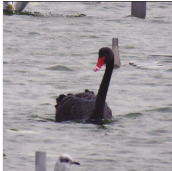
Figure 1. Black Swan Cygnus atratus in the lake of Assaraya Alhamra (Libya).

The observation of a Black Swan C. atratus at Assaraya Alhamra Lake in February 2026 represents a rare and noteworthy occurrence of this non-native species in Libya. Although almost certainly of captive origin, the record is of interest in documenting the increasing frequency with which exotic waterbirds appear in North African wetlands (Elsowayeb & Etayeb, 2022; Etayeb et al., 2025).