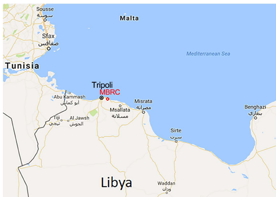
Figure 1. Localization of the collection site of algae.

Experiments were carried out in a domestic (Black & Decker, Model No. MZ