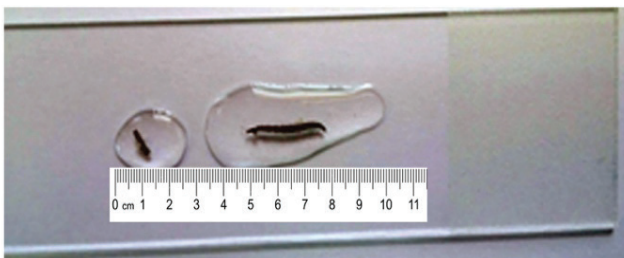
Figure 1. The fourth stage Psychoda albipennis larvae on glass slide

The patient was discharged and recommended to drink plenty of water and prescribed a urinary tract antiseptic to interfere with any secondary bacterial infection. A month later, the patient was followed up and large number of grayish worms were reported dead and discharged in the urine, clinically, abdominal pain and discomfort were disappeared.