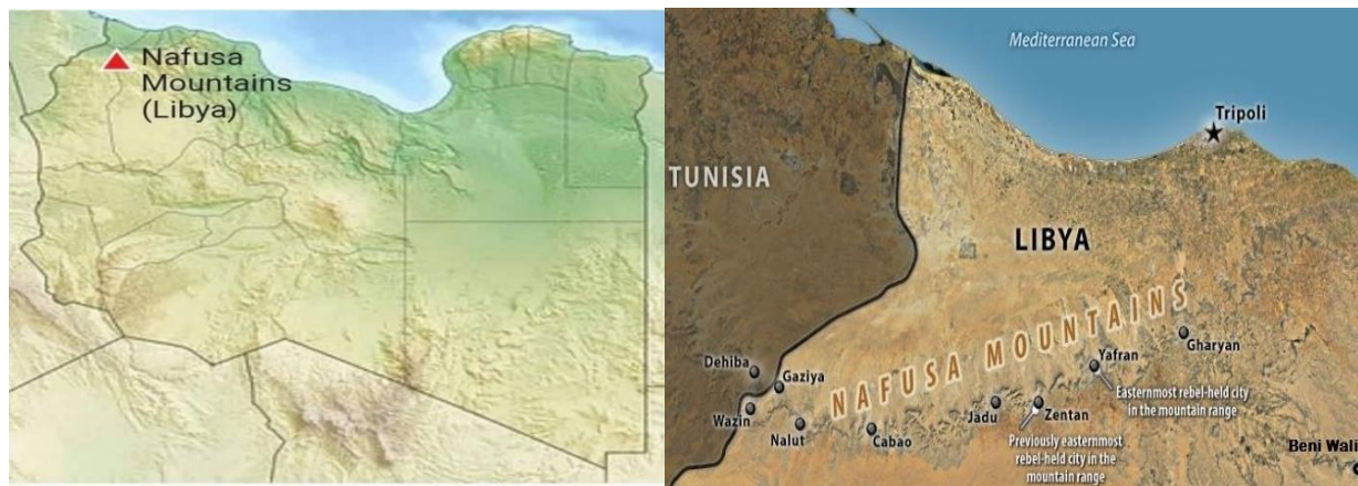
Figure 1. Map of Libya showing the location of Jabel Nafousa and main cities