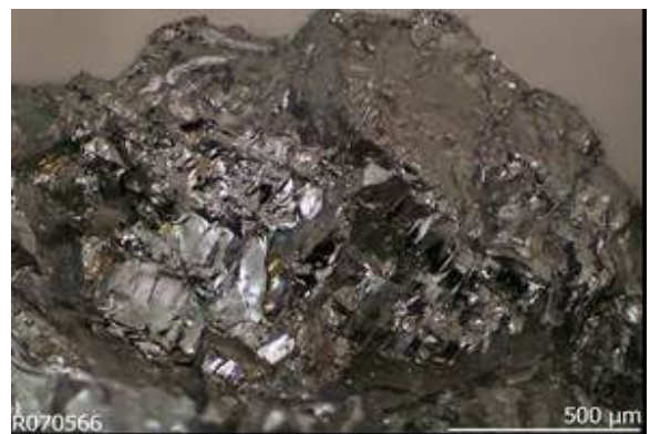
Fig. 3. Kitaibelite shiny metallic lead gray color

However, as shown in Table 2, all the investigated samples have the same general physical characteristics such as touch and transparency, they also have a greasy feeling in touching and stains fingers and skin while it is opaque. From the above-mentioned results, it can be concluded that Natural Arab Kohl has higher bulk density, higher particle size and lower specific surface area, but Natural Black Al-Athmod Kohl has a lower bulk density, lower particle size and higher specific surface area while Black Al-Hashemi Kohl is in between.