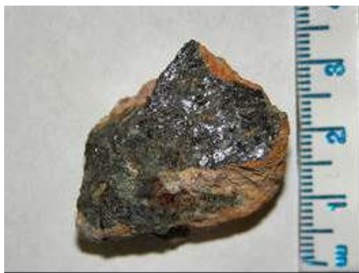
Fig. 2. Samarskite shiny black color