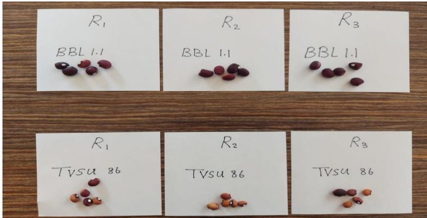
Figure 7. The shape of seeds in two genotypes of Bambara groundnut produced in the Al-Shaafeen field/city of Maslata in Libya.

The genotype showed BBL 1.1 clear superiority over the genotype Tvsu 86 in the average plant height (cm), number of leaflets per plant, number of leaves per plant, number of branches per plant, number of pods per plant, number of seeds per plant, fresh weight of pods per plant, dry weight of pods per plant, weight of seeds per plant, Weight of 100 seeds, and Total weight of seeds and was the fastest in maturing. Despite its delay in flowering.