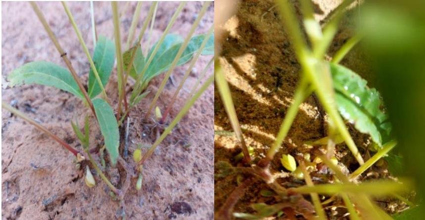
Figure 5. Performance of Bambara genotypes during the flowering stage in the Al-Shaafeen field/city of Maslata in Libya.

Note: (NF50%) number of days to 50% flowering, (NM50%) number of days to 50% maturity, (NPP) number of pods per plant, and (NSP) number of seeds per plant.