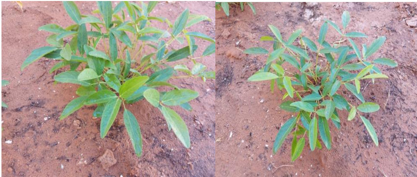
Figure 4. Performance of Bambara genotypes during the vegetative growth stage in the Al-Shaafeen field/city of Maslata in Libya.

Note: (PH) plant height (cm), (NLTP) number of leaflets per plant, (NLP) number of leaves per plant, and (NBP) number of branches per plant.