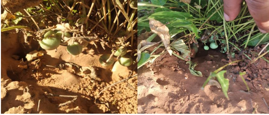
Figure 6. High pods load in individual plants of Bambara groundnut genotypes in the Al-Shaafeen field/city of Maslata in Libya.

The difference among the genotypes in the flowering date and maturity is natural because of the difference between them in their response to environmental conditions and the extent of their adaptation and performance, as well as, due to the genetic structure of genotypes, all these may influence the performance of plants and this is consistent with the study Shegro et al. (2013) which indicated that plants show certain changes in yield-related traits and showed that cultivar and environment may influence performance.