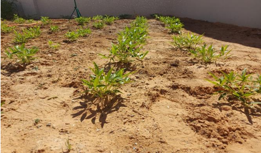
Figure 1. The photo for this experiment shows the growth of Bambara groundnut in the Al-Shaafeen field/city of Maslata in Libya.

When the plants reached maturity. The Fresh pods were weighed per plant. The pods dried under the sun for two weeks, then they were weighed dry and cracked to extract the seeds and weighed. Other data were recorded, and this experiment was under a system with full irrigation. All results were analyzed using the GenStat 19 statistical program, and a one-way analysis of variance (ANOVA) was performed to evaluate differences in some characteristics of the studied genotypes. The least significant difference (LSD) was used at a significance level of 5%.