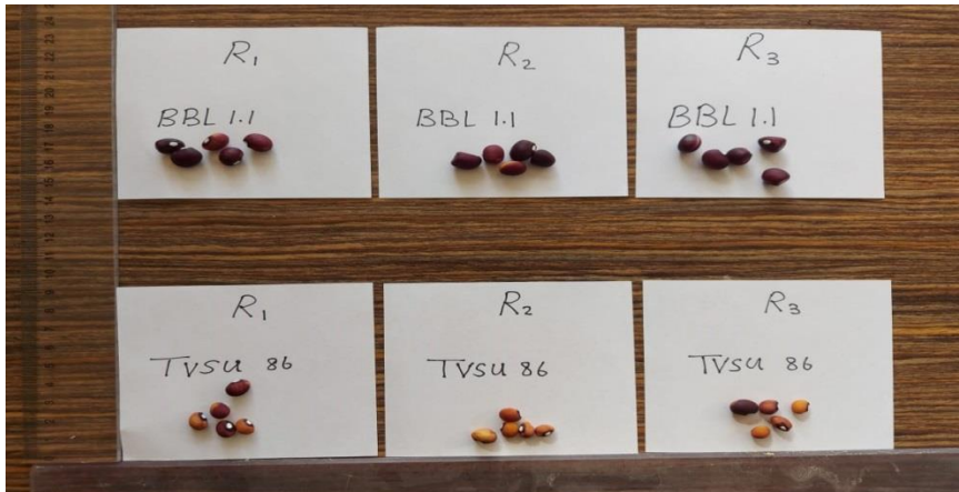
Figure 3. Morphological appearance of seeds for genotypes BBL 1.1 and Tvsu86 after the end experiment and harvesting of the plants.