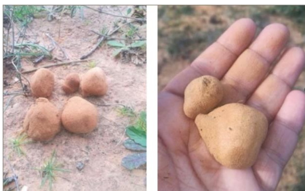
Fig 2: Pictures of the harvested Terfezia which were used in the present study

Although truffle collectors have been using dogs to find truffles in most European countries such as Finland and Italy, however, Libyan truffle collectors never use dogs to find natural matured truffles. In Libya, matured truffles rise up and telltale cracks the soil surface, this indicating the presence of a truffle underneath it. All truffles ascocarps collected during the last seasons were morphologically identified as Terfezia (called as red/black truffle) which is depicted in Figure 2, which is a common species of Terfezia that grows naturally in Libya. Terfezia has been growing wildly in many regions of Libya, although the valleys and foothills of the mountains of Libya are rich in precious truffles, the most famous of them is the Al-Hamada Al-Hamra area, about 500 km southwest of the capital, Tripoli. The phylogenetic analysis of the genomic rDNA ITS of the next seasons harvested truffles will be investigated in order to identify all possible species of Terfezia .