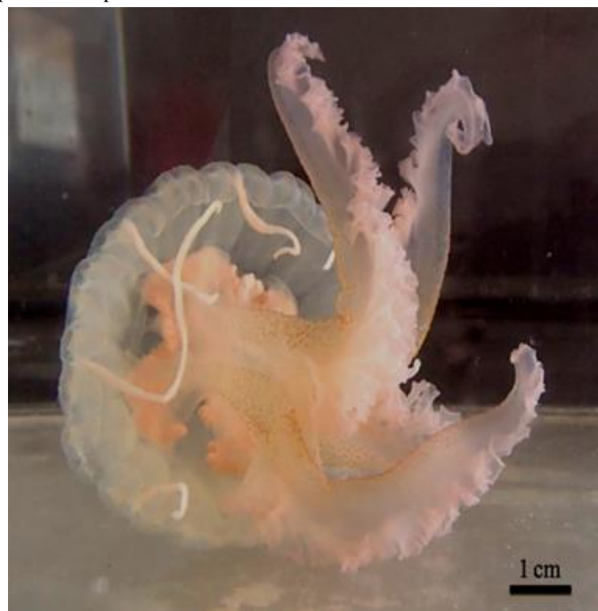
Fig. 2: General morphology of Pelagia noctiluca .