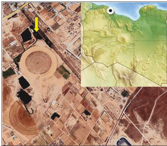
Figure 1. The sewage treatment lagoon of Al-Saket site in Misrata about 200 km east to Tripoli (Libya).

The only one specimen bird observed showed the typical appearance of this species with a black neck and head, a distinctive white face, and a long