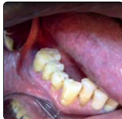
Fig. (1b) Widespread multiple unilateral grayish- white non scrapable patches on the right lateral border of the tongue posteriorly extending to the floor of the mouth