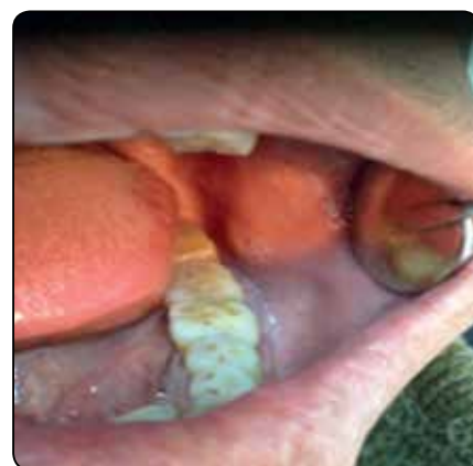
Fig. (2) The left buccal mucosa as well as other sites of the oral cavity appeared normal