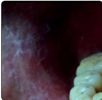
Fig. (3a) Reticular pattern showing white lines of striae on the buccal mucosa.