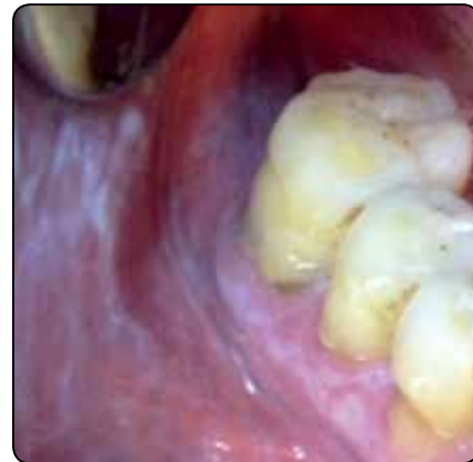
Fig. (3b) Plaque pattern showing a homogenous white plaque in conjunction with striae on buccal mucosa and gingiva