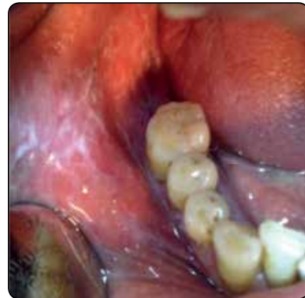
Fig. (1a) Widespread multiple unilateral grayish- white non scrapable patches extending from the right commissure of the mouth, buccal mucosa, lower right posterior buccal vestibule, posterior gingival segment up to the retromolar area.

Histopathological examination with H&E stain revealed parakeratinized stratified squamous epithelium along with the underlying connective tissue stroma. The epithelium was atrophic showing absence of rete pegs. Focal areas of the epithelium also showed degeneration of basal cells. A band of juxta epithelial inflammatory cell infiltrate was evident, chiefly comprising of lymphocytes and plasma cells (fig.4). IHC staining showed subepithelial immunopositivity reaction for CD8 + T cells (fig.5). Based on the histopathologic findings, were consistent with the diagnosis of unilateral oral lichen planus. The patient was advised to avoid eating spicy foods while his lichen planus was active and to use topical corticosteroid cream containing 0.1 percent triamcinolone acetonide (Kenacort), when symptomatic. Initial review after a three-month period showed a reduction in symptoms and severity of the reticular lichen planus. The patient is currently continuing follow-up.