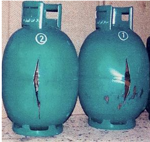
Fig.3. Failure Locations of the cylinders.