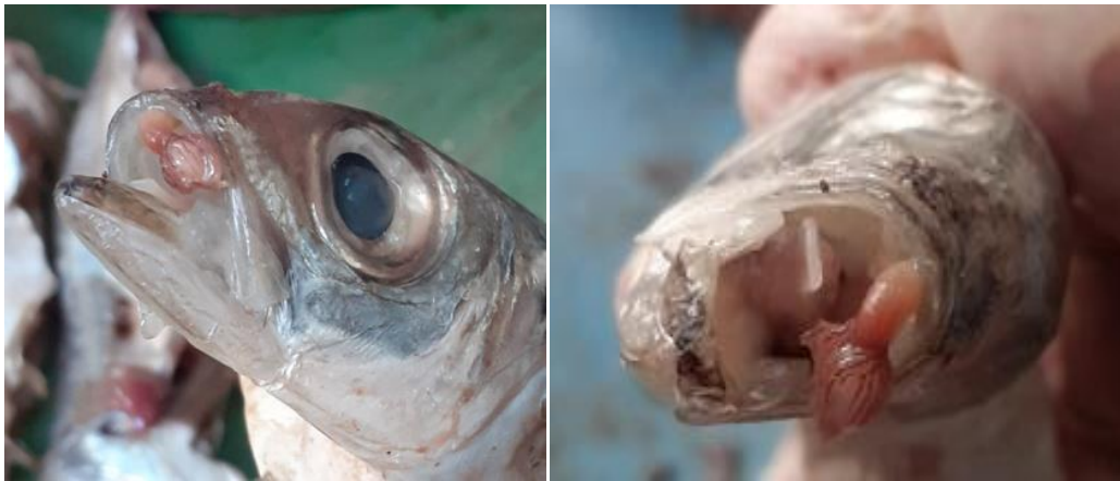
Fig (1) Lernaeolophus sultanus in Trachurus trachurus

One female L. sultanus specimen was removed from the buccal cavity of Trachurus trachurus fish (total length 18.8cm and total weight 46g). This parasite has a cephalic holdfast, deeply embedded in the maxillae of the host tissues (Figure 1).