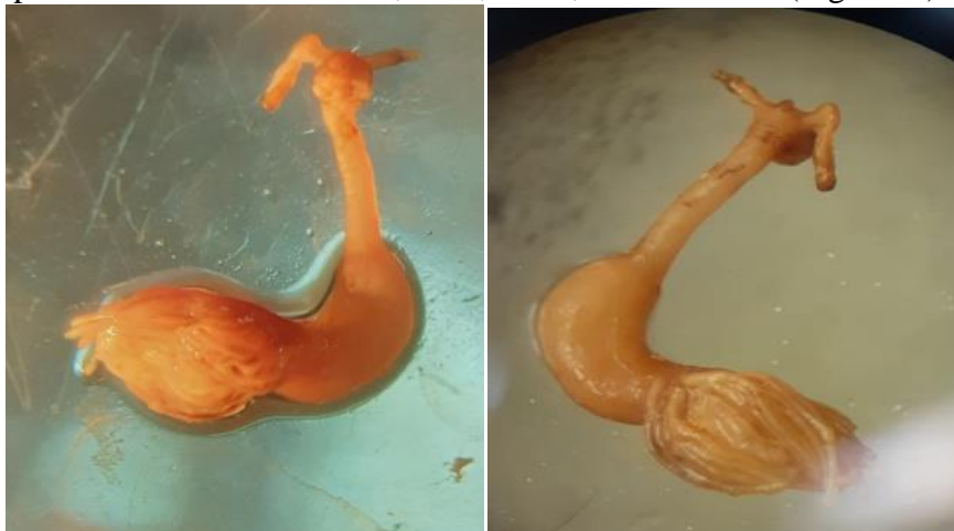
Fig (2) Morphology of adult female of Lernaeolophus sultanus

An adult female L. sultanus specimen with a total length of 18.5 mm was reported, its body was macroscopic and divided into a head, neck, trunk, and abdomen (Figure. 2).