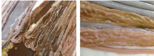
Fig. 1. Left: Morphological appearance of paratuberculosis lesions in the ileum and jejunum of sheep clearly show thickening and corrugations of the mucosa. Right: A closer view of the lesions.

The most striking gross lesions observed were the mucosal corrugations of the ileum and jejunum (Fig. 1) as well as chronic lymphadenitis of the mesenteric lymph nodes.