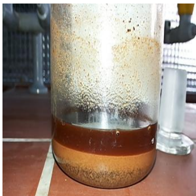
Fig-2: Grape seeds cold maceration