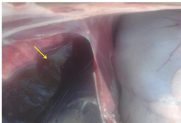
Figure 3. Accumulation of bloody fluid in the thoracic cavity of an animal with Pasteurella infection (yellow arrow).